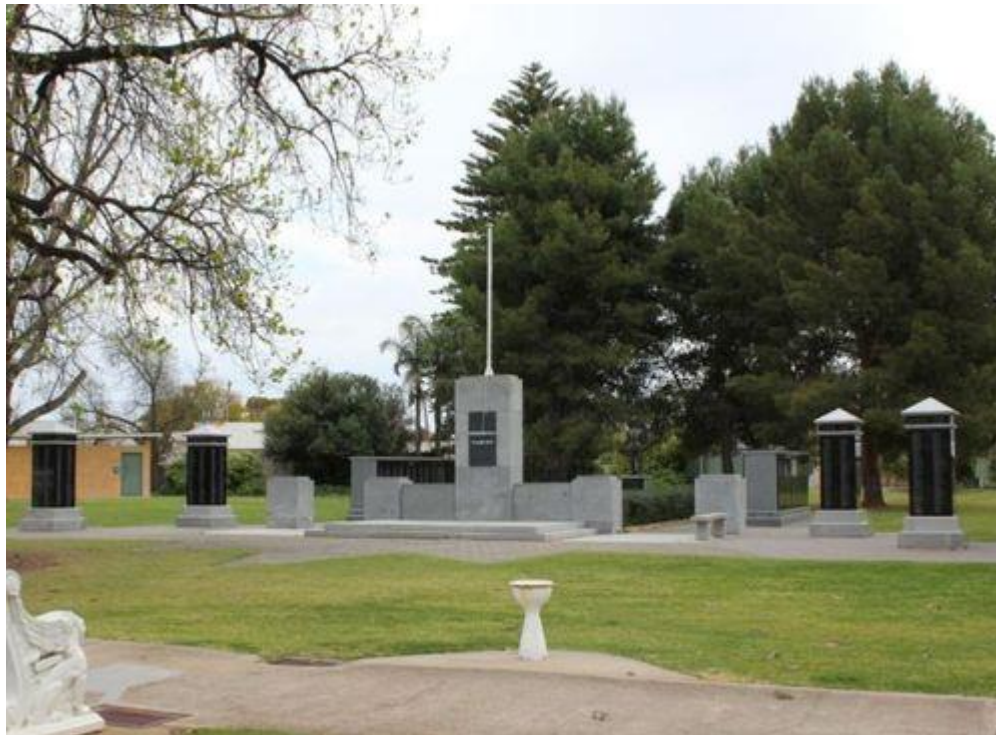
Mildura Cenotaph