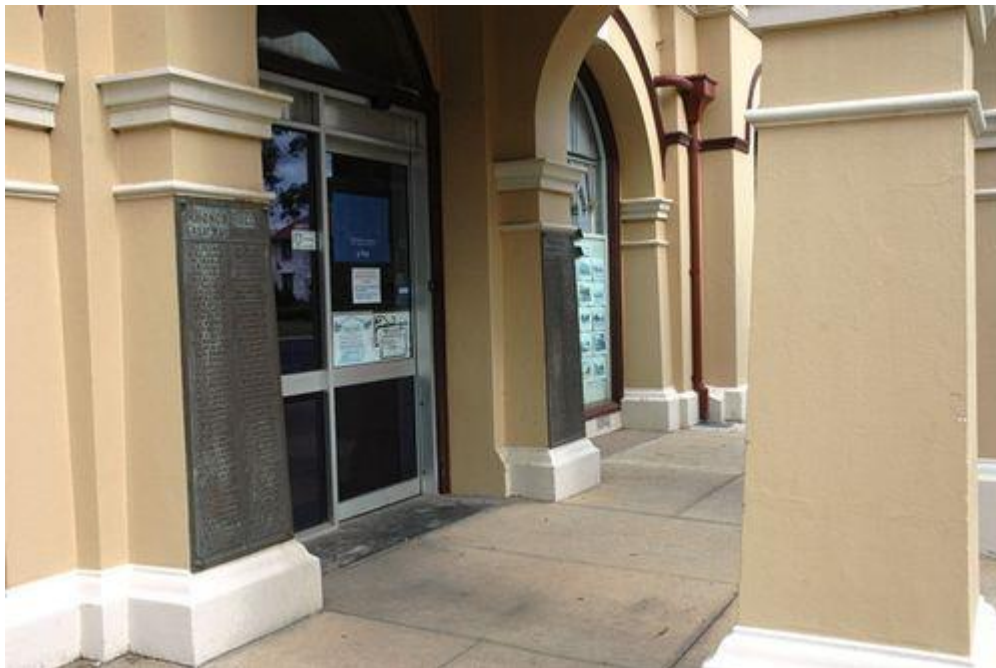
Carnegie Library Honor Roll