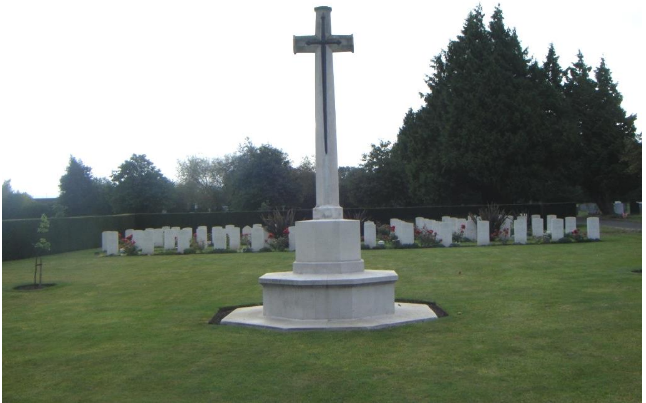
Gloucester Old Cemetery